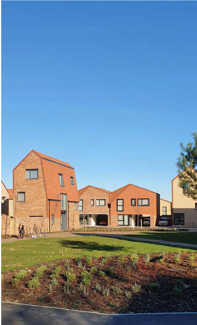
Beechwood Village, Pollard Thomas Edwards. Basildon. A new neighbourhood of over 250 volumetric family houses for sale to people on moderate incomes. Factory-built modular technology offers an outstanding range of consumer choice, creating unique homes, which customers have designed to suit their own needs and aspirations.