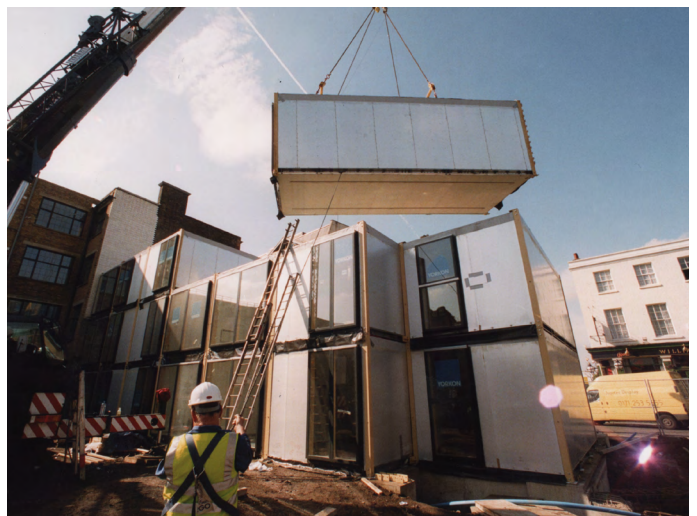
Murray Grove, Cartwright Pickard. Hoxton, London. Construction detailing of the ground floor requires particular attention in volumetric projects as the floor construction itself is at or below ground level and potentially vulnerable to water ingress and thermal bridging (cold spots where the insulation is not continuous).