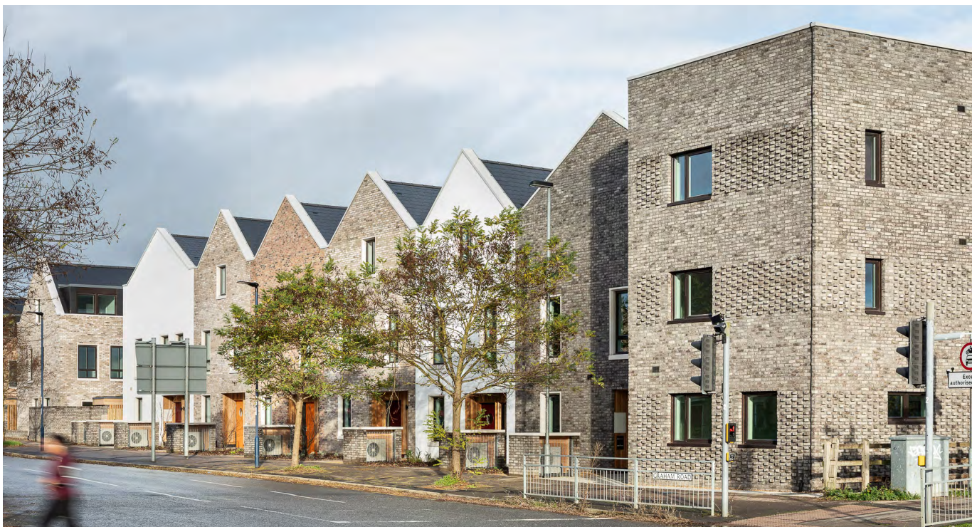
Marmalade Lane, Mole Architects. Cambridge. Marmalade Lane is constructed from pre-fabricated CLT (cross laminated timber) structural panels supplied by Swedish manufacturer Trivselhus. CLT systems use solid panels of timber built up from multiple bonded sheets, rather like plywood but much thicker. Insulation is applied to the CLT panels on site and external finishes and other facings, built with traditional methods, are separated from the frame and insulation by a ventilation cavity.