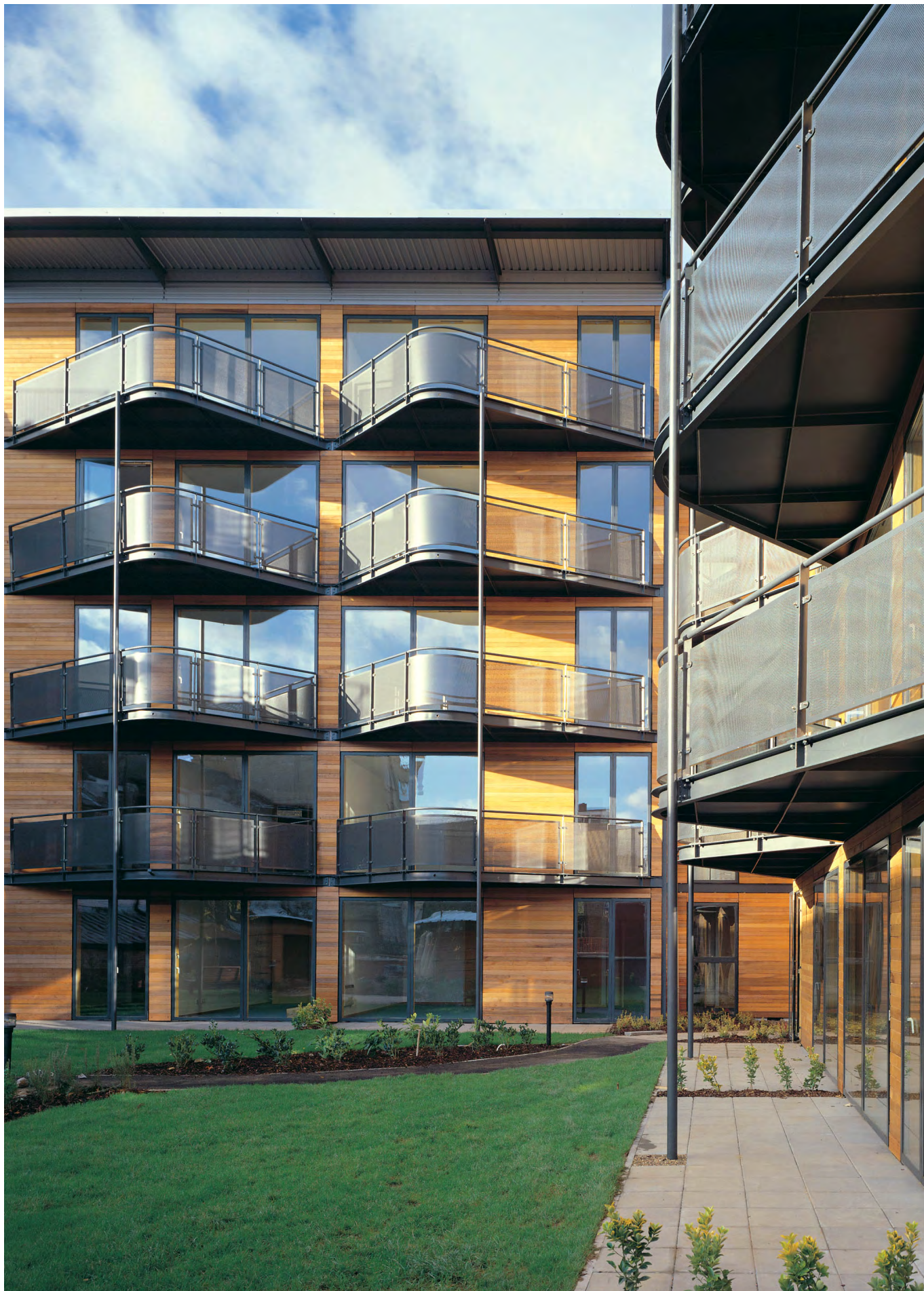
Murray Grove, Cartwright Pickard. Hoxton, London. An early volumetric scheme for key workers built by Peabody. The timber and terracotta cladding was applied on site but the volumetric units were delivered with all of the bracketry and fixings necessary to receive the cladding. Internally they were fully fitted out and decorated. The attention paid to detailing and the high quality external materials have ensured that this building retains its appeal twenty years after its construction.