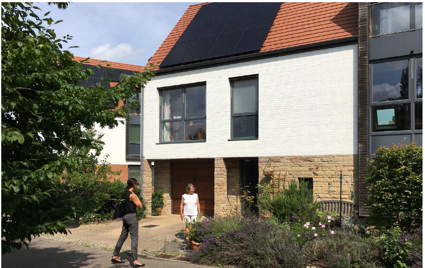
Derwenthorpe, Studio Partington. York. This house illustrates the use of modern methods and offsite manufacture. The roof was delivered as a single "cassette" with insulation, waterproofing and tiling battens pre-fixed in the factory. The walls use a method known as thin bed blockwork where highly insulating aerated blocks are bonded together to make the inner leaf of the cavity wall. Note that the whole house can be insulated and watertight, here the windows are already installed, before the external finishes are built up. These methods were used because of the speed of constructing walls and roofs, with the external facing finishes off the 'critical path', and to allow a variety of facings including the base of recycled random-coursed stone walling.

Modern Methods of Construction: introducing the MMC definition framework