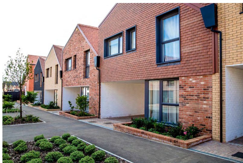
Beechwood Village, Pollard Thomas Edwards, Swan Housing Association. Basildon. Constructed utilising MMC at Swan's in-house factory using Cross Laminated Timber (CLT).

Living with beauty: report of the Building Better, Building Beautiful Commission