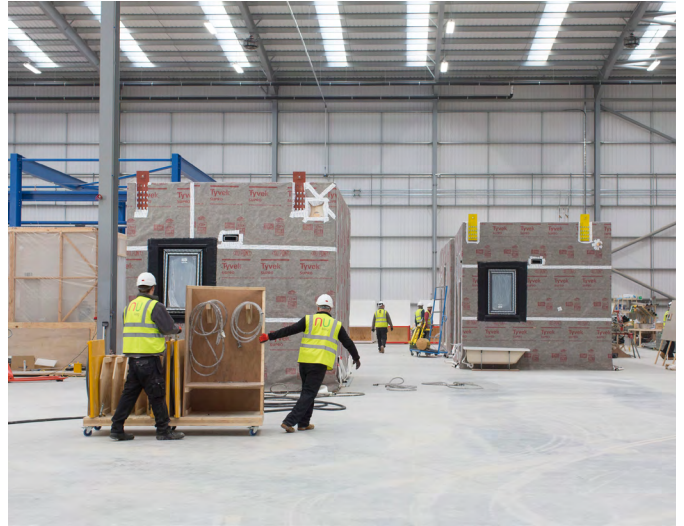
Swan NU build factory.