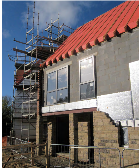
Derwenthorpe, Studio Partington. York. The scheme was named best sustainable project at the AJ Architecture Awards 2017.

In 2019 the MHCLG (now the DLUHC) regularised and refined the term MMC, by describing the broad spectrum of innovative 'Modern Methods'.