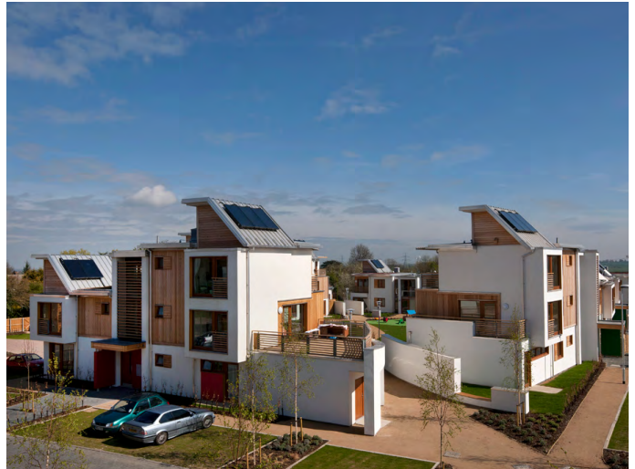
Cole Thompson Anders. Letchworth Garden City, Hertfordshire. A low-energy addition to Letchworth Garden City built to the code for Sustainable Homes level 4 using pre-fabricated timber panels.

More recently, members of the County's local authority and affordable housing sector have come together to form the Hertfordshire MMC consortium.