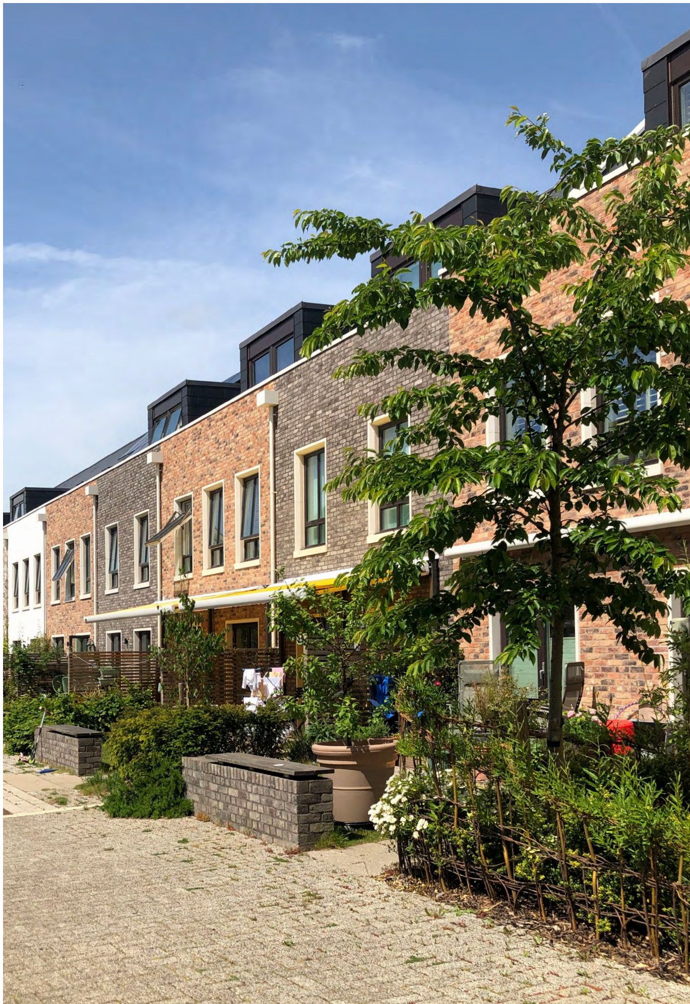
Marmalade Lane, Mole Architects. Cambridge.