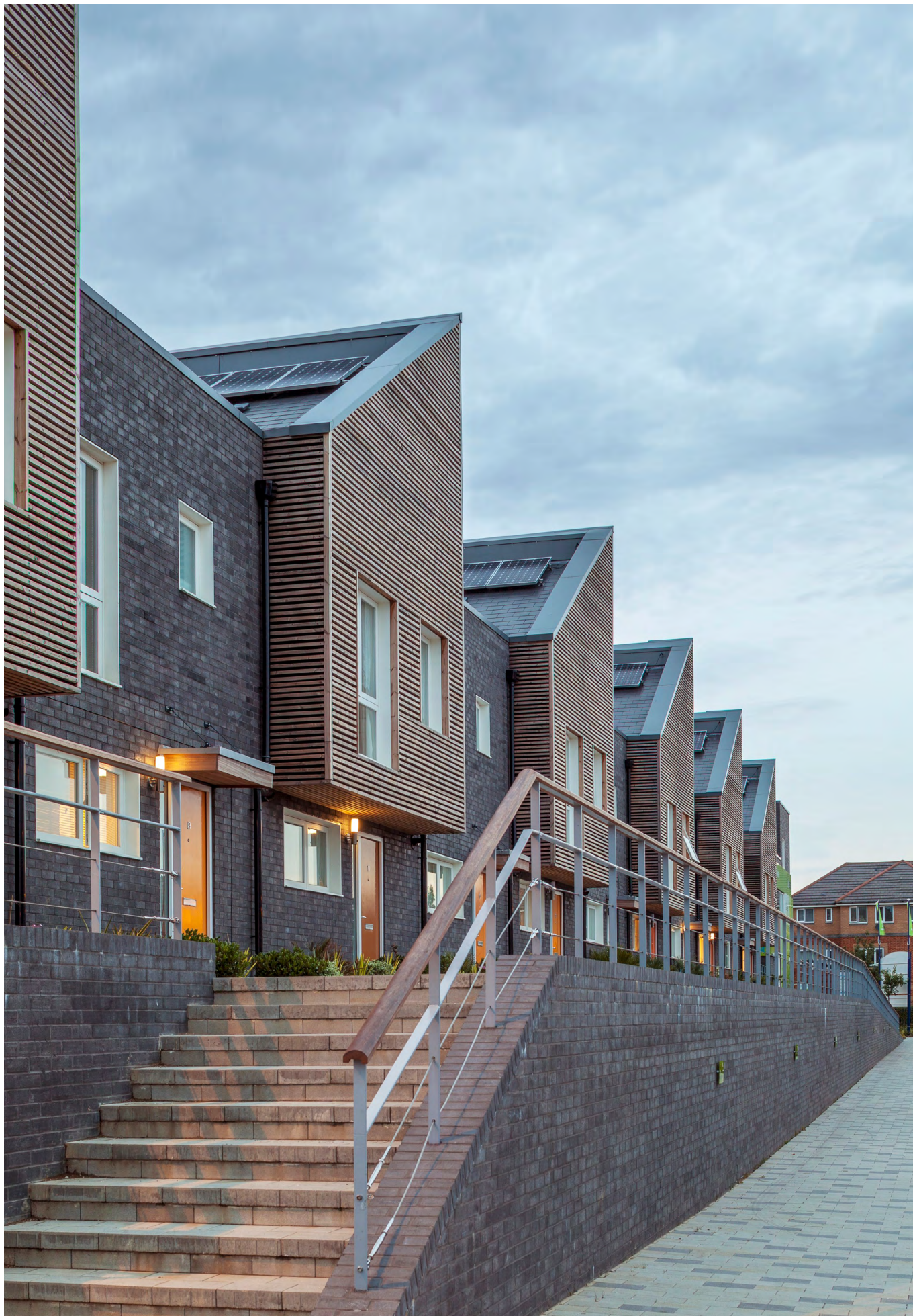
Barking Riverside by Sheppard Robson. London. Large scale application of offsite manufacture at Barking Riverside. Housing Design Award winner in 2013.