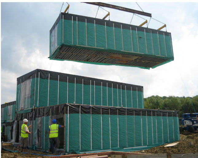
SLO, South Chase Newhall, Proctor and Matthews Architects. Newhall, Harlow, Essex. Modular units craned into position onto pre-prepared foundations. Note this form of construction is less suitable for constrained or hilly sites. Level access and enough room is needed for the delivery vehicles and cranes and the modular units must be located on a very level base to keep their alignment as units are stacked one above each other. Though the 'Spaceover' product is no longer available the design principles are common to other modular schemes - see also Murray Grove (image to the right).

The Herts offsite consortium is working with Donaldson Timber Systems and Elements Europe to open a factory, create a pipeline and produce pattern books.