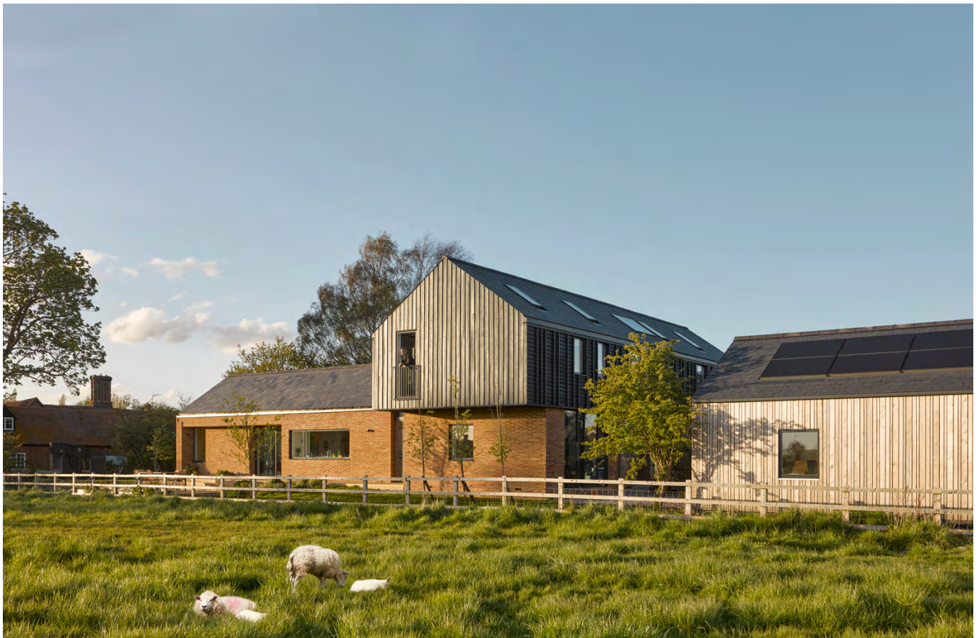
Loxley Stables, TAS architects. Tring, Hertfordshire. Loxley Stables is a sensitive self-build development consisting of three low-energy houses set in the original grounds of Loxley Farm, a 16th century Grade II listed historic house in a Hertfordshire village. One of the houses was built using passive housing strategies to act as a test bed for low-energy, offsite construction. Though each house is unique, featuring handcrafted details, collectively they epitomise a modern, sustainable community.

By investing in skills and resources we are gearing up our delivery machine and by playing a bigger role in direct delivery we will enable more access to market housing. Offsite and Modern Methods of Construction will help increase the rate of housing delivery, in part because there are not enough construction workers available to deliver these higher rates in Hertfordshire or any other part of the South East. It is also an opportunity to address specialist housing need at the same time reducing unnecessary costs to the public sector.