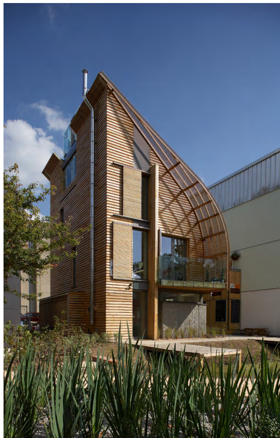
Lighthouse by Sheppard Robson. Watford. One of the Building Research Establishment (BRE) Innovation Park demonstration homes built near Watford. The home uses SIP (structurally insulated panels) and achieved the highest level of environmental performance. The innovations from this prototype home were then applied at scale at Barking Riverside.

Standard layouts will not always be suitable, for example when there are difficult site conditions, or special positive site features to be addressed, or where they do not meet locally defined standards. Using design codes, soon to become integral to planning, is a good way to make sure the standard layouts are right for each site. We are lucky in Hertfordshire to be piloting the best approaches to using design codes with Dacorum Borough Council and can learn together.