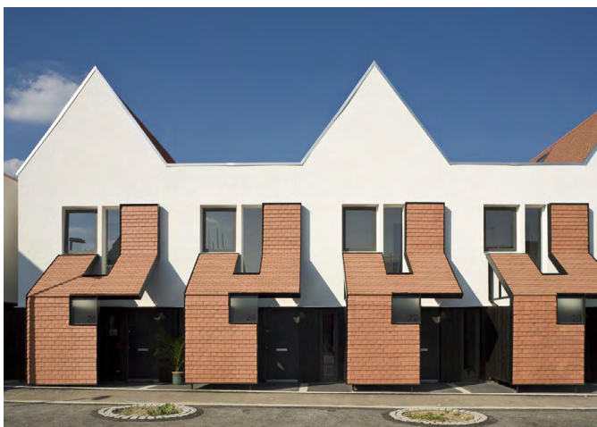
SLO, South Chase Newhall, Proctor and Matthews Architects. Newhall, Harlow, Essex. These homes were built with modular steel units manufactured by Ayreshire metal from a system called 'Spaceover'. The architects have used the canopies and front entrances as the main architectural feature, providing a high quality applied screen behind which the modular units combine to create deceptively simple houses. Note the very high quality of internal finish that can be achieved with factory modules. Though the 'Spaceover' product is no longer available the design principles are common to other modular steel schemes - see also Murray Grove on page 16.