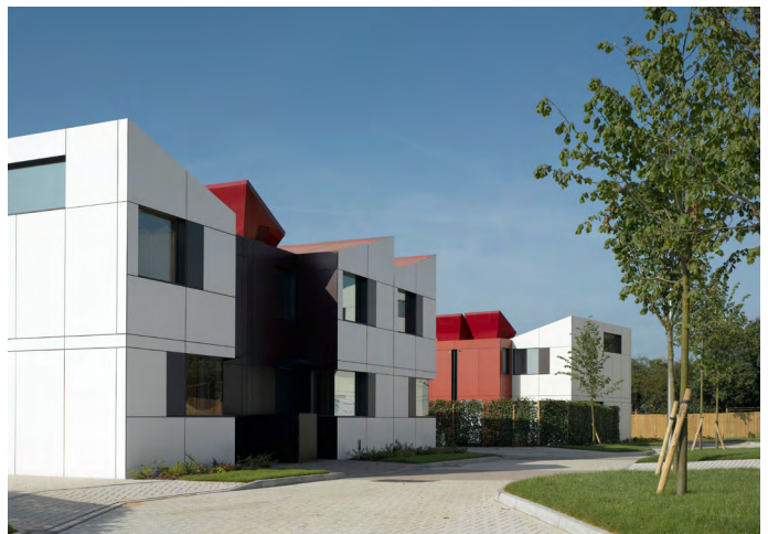
Oxley Wood, Rogers Stirk Harbour and Partners. Milton Keynes. Built as part of the Design for Manufacture programme Oxley Wood won many design plaudits. The construction is a closed panel timber frame, with insulation and facings boards fitted in the factory. Service including a mechanical ventilation unit were pre-fabricated and delivered in the pyramid shaped roof 'pod'.