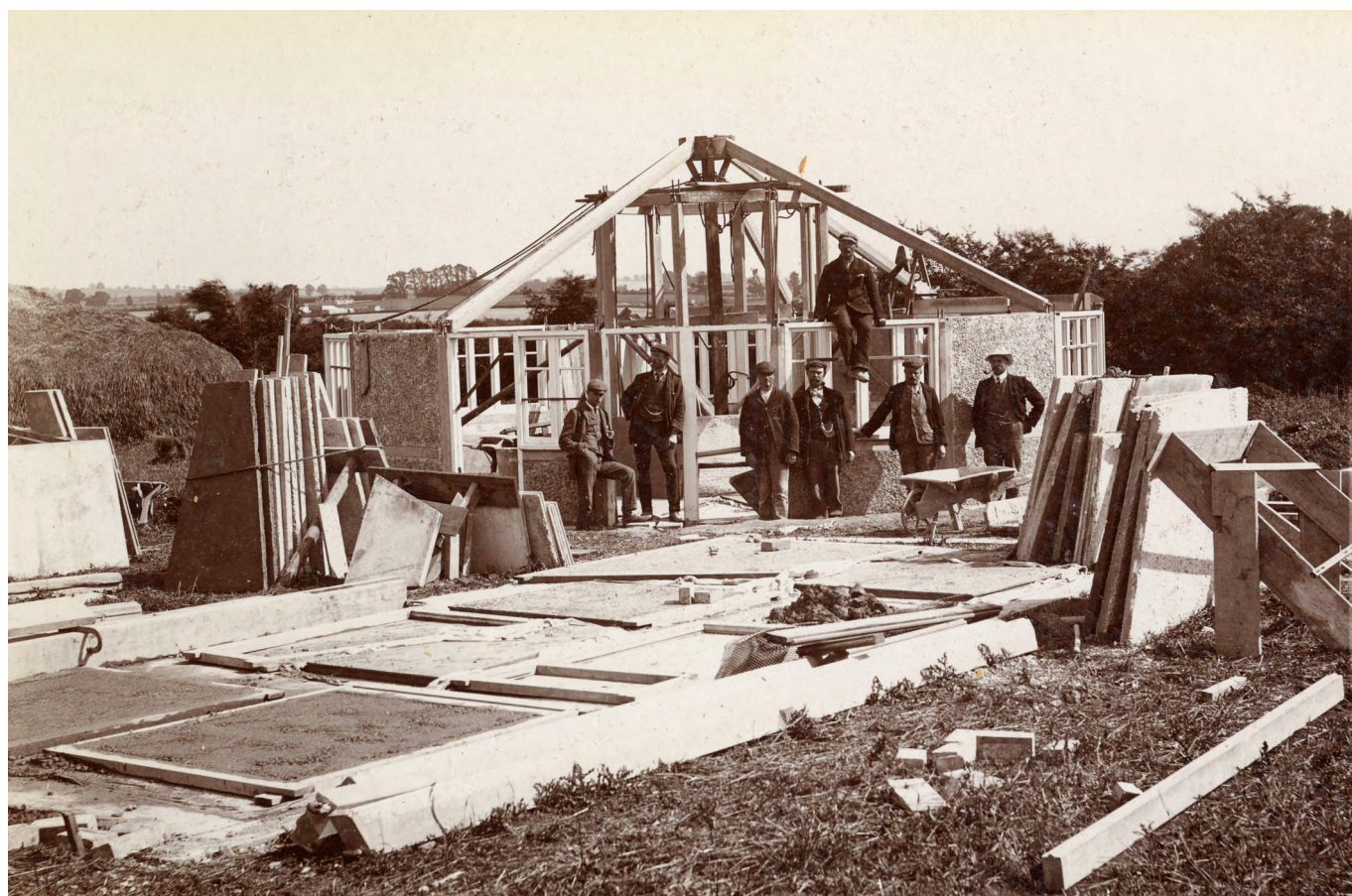
Letchworth Garden Homes. Letchworth, Hertfordshire. Experimental steel framed cottages, as well as avant-garde pre-cast concrete systems and site labour-saving formwork systems using waste materials featured in experimental designs at the 1905 Letchworth Cheap Cottages Exhibition.